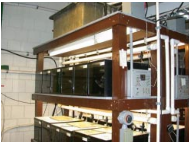
MARY ANN ABIADO

Briefly, the experiment at OhSU involved replicated tank systems stocked at a density of 20 fish per tank. Three tanks were randomly assigned to one of four diets. Diets contained the identical protein source (casein-gelatin) and were supplemented with 15% wheat meal (diet 1 as a control); 15% freeze-dried camu-camu meal (diet 2); 15% freeze-dried aguaje mesocarp (diet 3); and 15% pulverized and dried maca root (diet 4). The fish (2 g initial weight) were fed experimental diets three times per day, seven days per week, at a decreasing rate, with feeding restricted from 4 to 2.6% body weight.