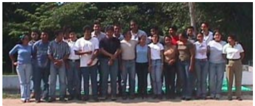
Members of the Laboratory of Aquaculture at UJAT, Mexico.